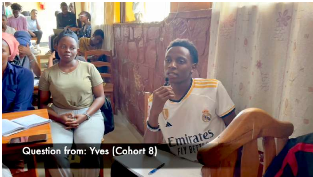
Snapshot from the video of the conference

https://www.youtube.com/watch?v=0H0wHYJDJQ