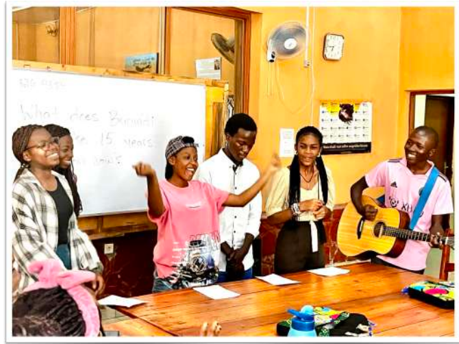
Lyrics from an original song composed by Tujenge students, in response to the prompt “What does Burundi look like 15 years from now?”